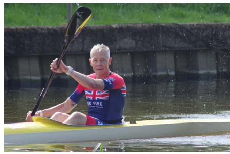
Fire and water.