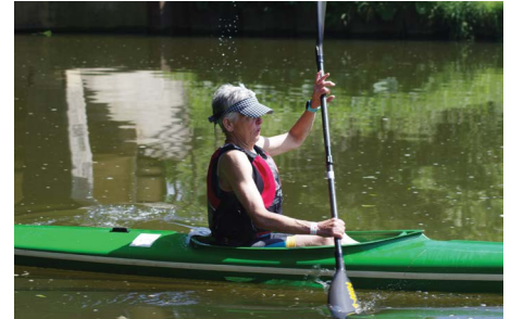
Using a stable racer.