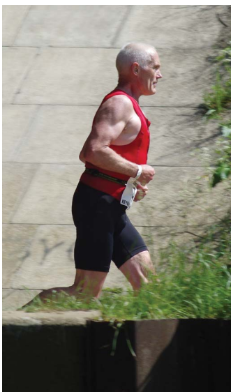
The new run course by the river.