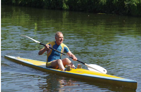
A surfski worked well, slower on turns.