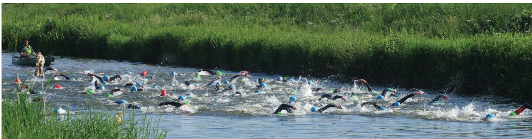
The swimmers head up the New River Ancholme.

On the bikes, Martinou opened up just 7 seconds on Rousavy, negligible after 48 minutes on the road. Csima slipped a further three minutes on the leaders. Oliver Fairbairn was the next fastest cyclist, two and a half minutes behind them on the road but 11 minutes behind overall.