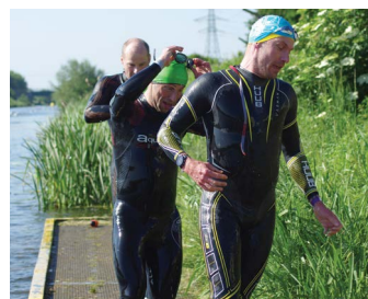
First out of the water.