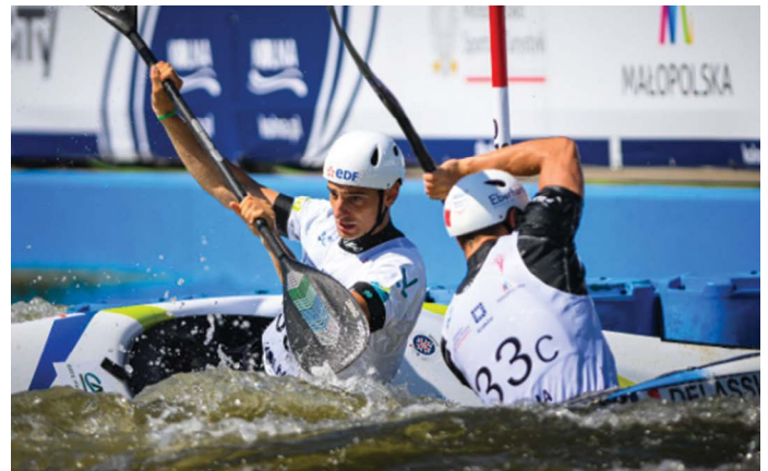
French team in action.