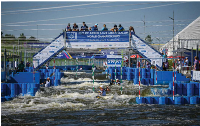
German team on the course at Kraków.