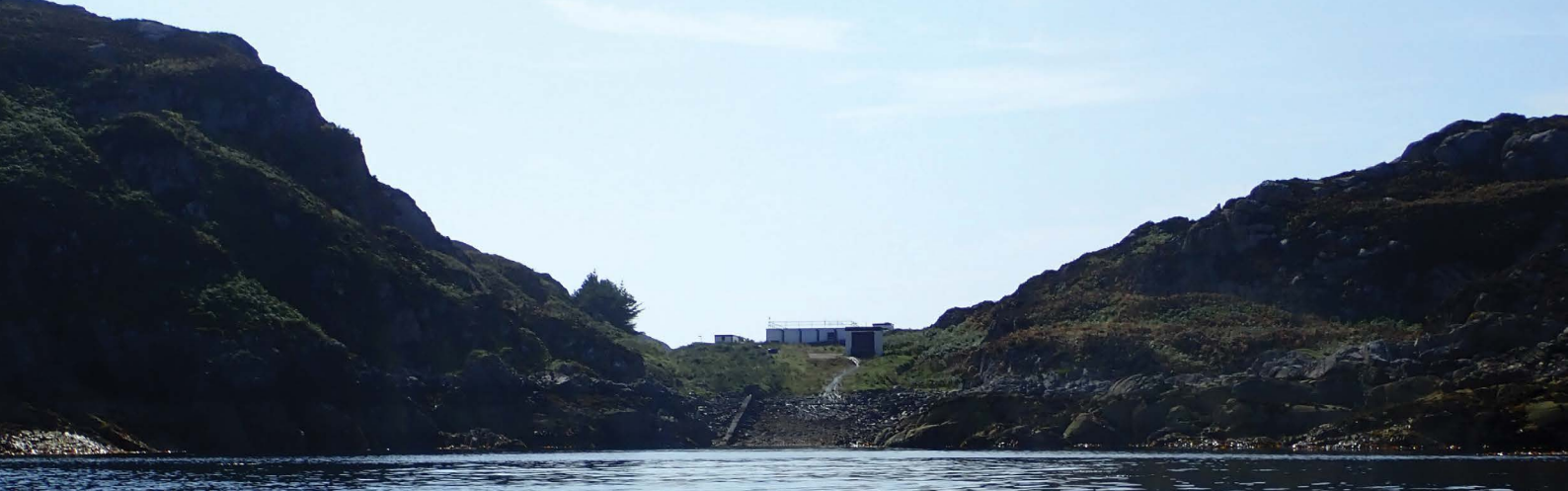
The control building with its cables into the sound.