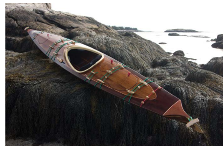
Shooting Star of 2018 is a 4.9m Baidarka.