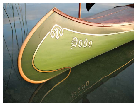
This courting canoe of about 1915 has unusually long decks for a cosy space for two.