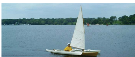
A 4m Oughtred McGregor trimaran sailing canoe of 2004.