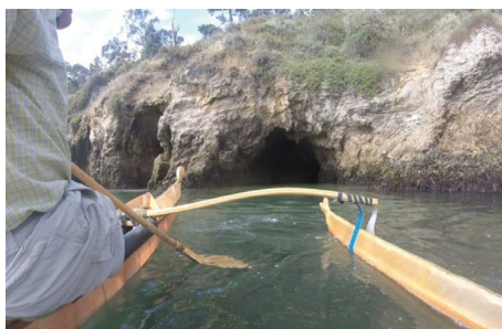
A 3.7m skin on frame ultra lightweight Hawaiian outrigger concept.