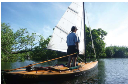
Sylph is a 4.6m sailing canoe of 2004.