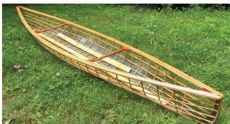
Joy is a Monfort Arrow 14 with a clear vinyl skin, to puzzle spectators.