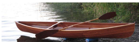
Mary Oliver is a 3.7m Herbert of 2013.