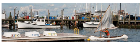
This 1900 Kingsbury canoe has a lateen sailing rig.