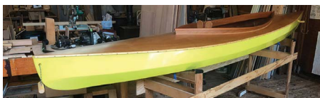
This 4.4m Fox was built in 2019 with a 2m long cockpit.