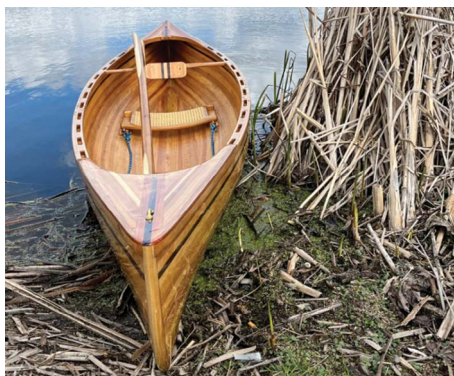
Wee Lassie, a 3m cedar strip canoe built in 2023 to a design inspired by Rushton's 1890s models.