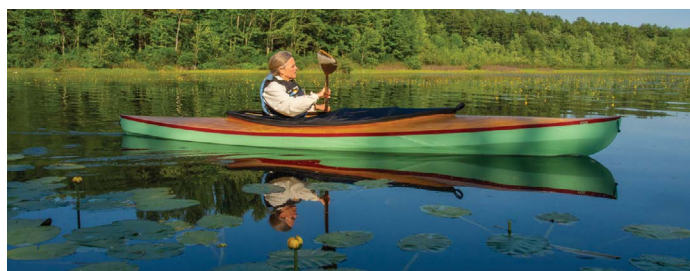
A 4.6m stitch and glue Fox of 2006.