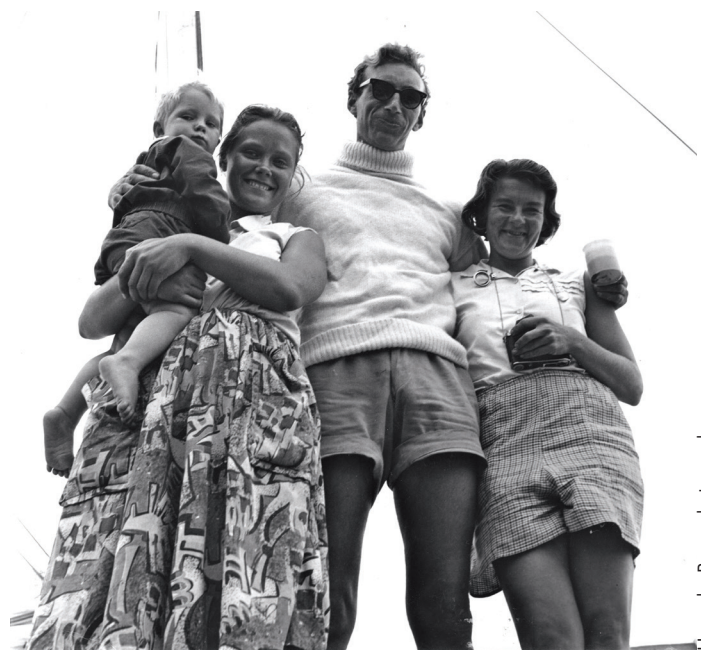
The crew in New York.