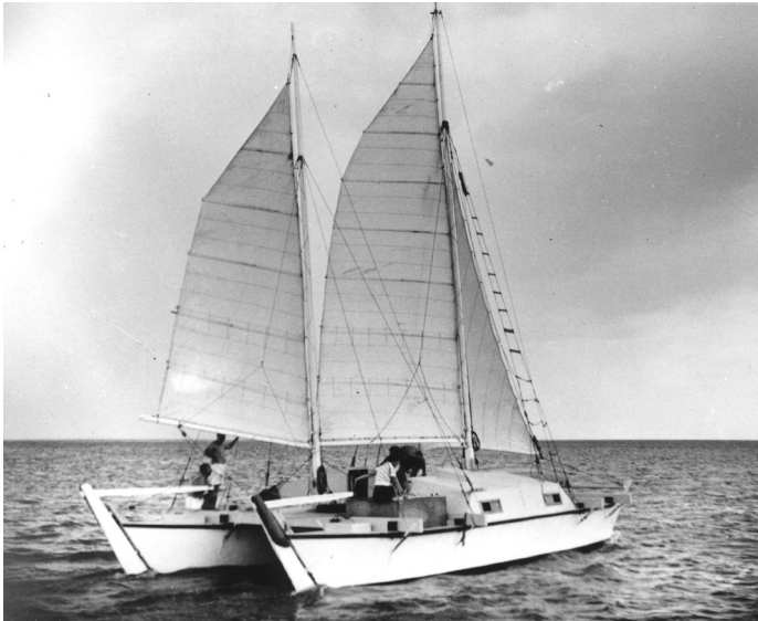
Rongo at rest.

from the first west to east crossing of the North Atlantic by catamaran