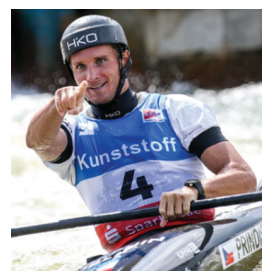
K1 men's winner Prindis.