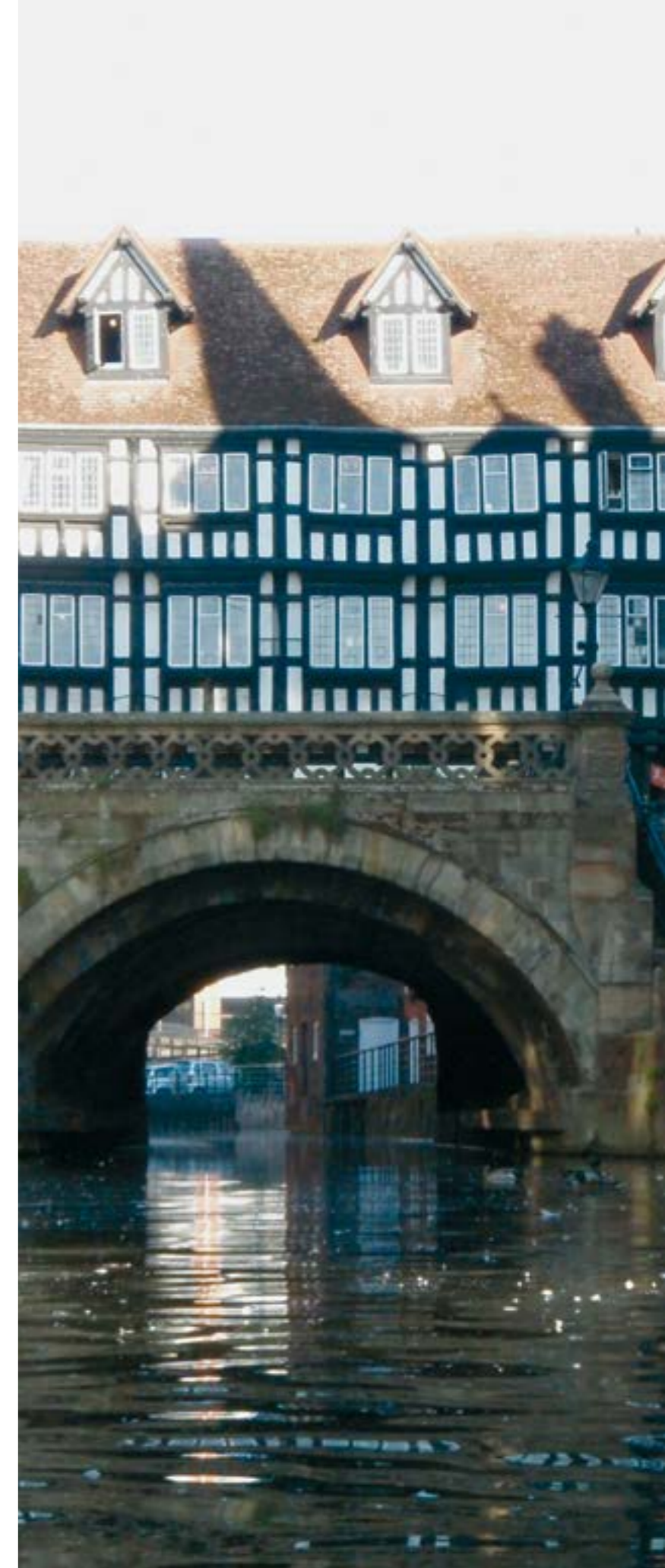
The Glory Hole, Lincoln, River Witham.